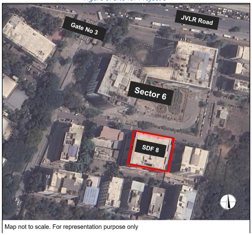
Figure 3: Site for Project 3